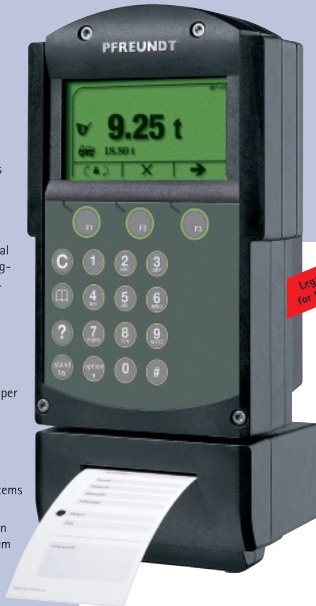
Illustration WK 50

Ask us about our efficient P.O.S. branch software