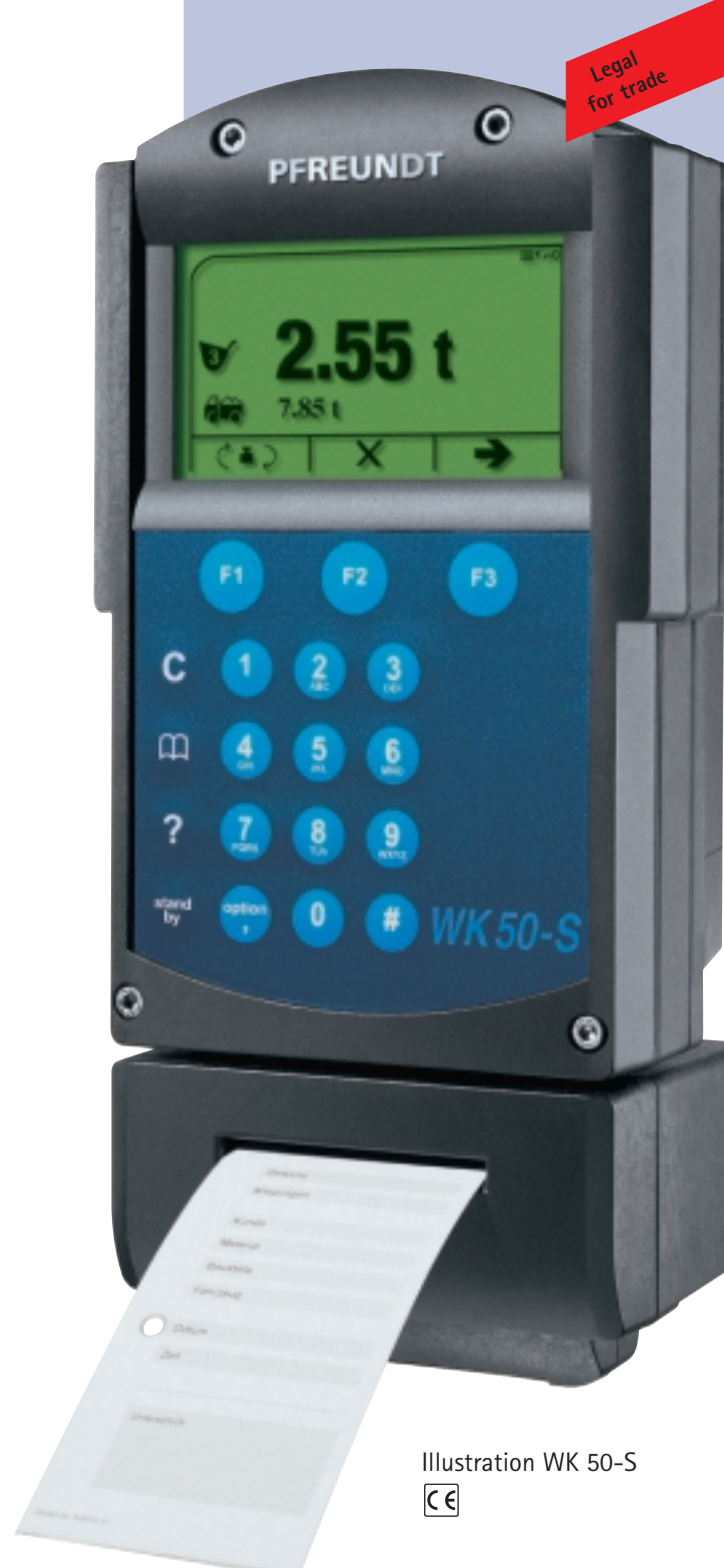
Illustration WK 50-S

Upgradable to the WK 50 by simply changing the electronics.