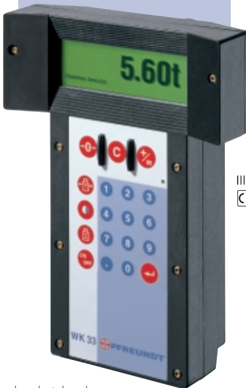
Illustration WK 33

This weighing system has been designed for optimal loading efficiency – avoiding overloads or underloading capacities – saving additional travelling and money as well as optimising operations overall.